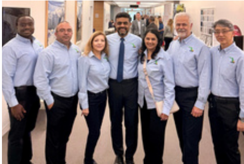
SESHP OFFICERS 2026

The Best in its Class Together, we set the benchmark.