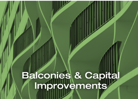
Balconies & Capital Improvements