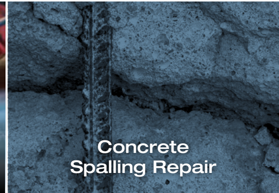
Concrete Spalling Repair