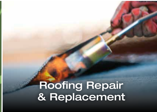
Roofing Repair & Replacement